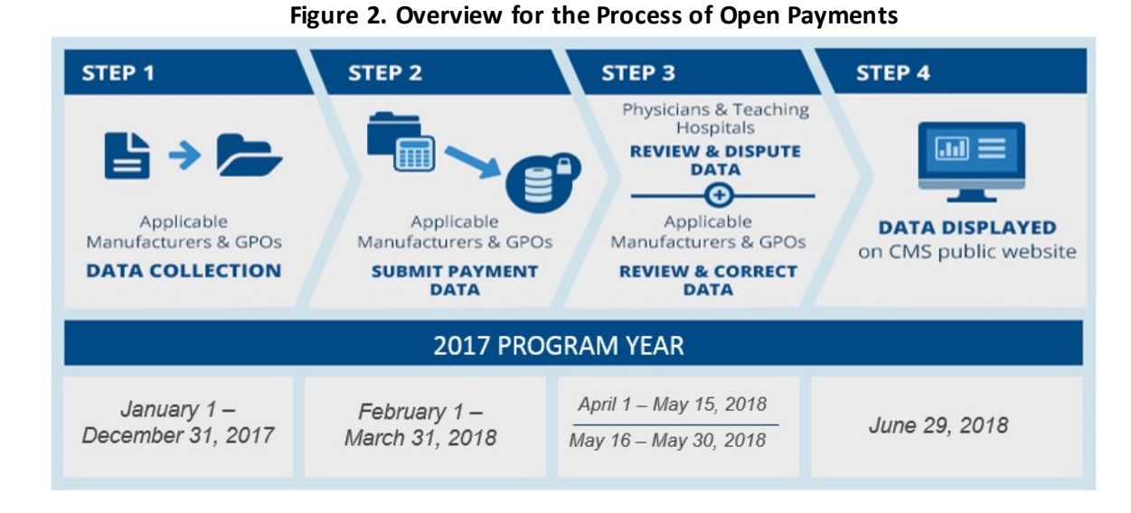
Figure 2 provides a visual of the Open Payments Program Cycle.

<u>Data Publication</u>: CMS publishes the data annually on or by June 30<sup>th</sup>. The data is displayed on the CMS public website at <u>https://openpaymentsdata.cms.gov</u> On June 29, 2018 CMS published Program Year 2017 data along with the refreshed data<sup>7</sup> from previous program years (2013 – 2016).