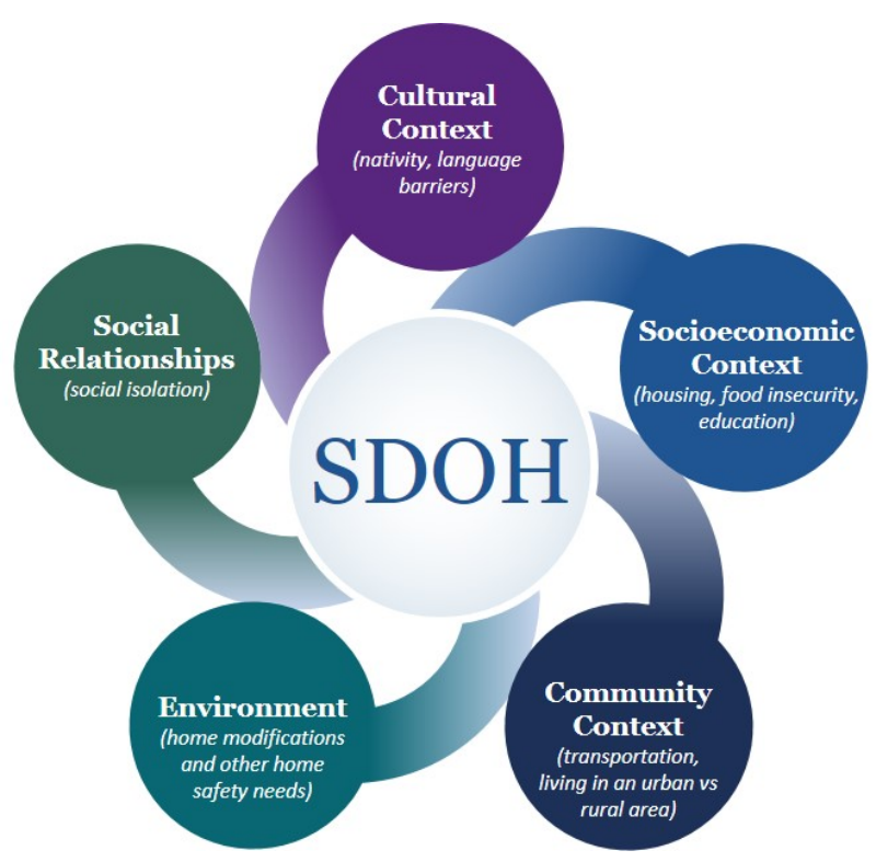
Figure 3. SDOH domains

SDOH that emerged in our evaluation fall into the domains shown in Figure 3 . We use these domains to organize our discussion of SDOH-specific approaches, which States and MMPs use in conjunction with the broad approaches discussed above (e.g., HRAs and care planning).