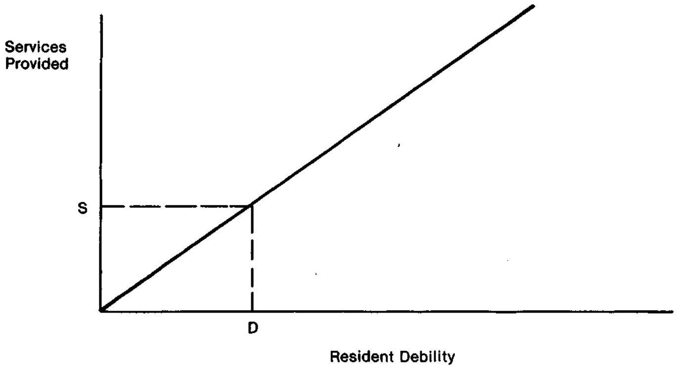
FIGURE 1 Presumed Ideal Relationship Between Debility and Services