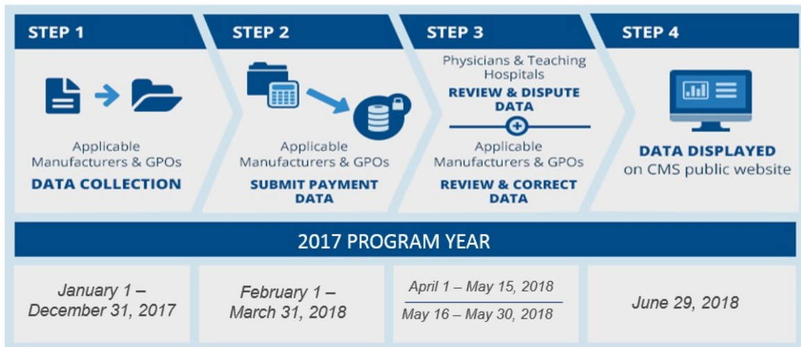
Figure 2. Overview for the Process of Open Payments

Figure 2 provides a visual of the Open Payments Program Cycle.