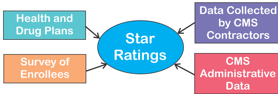
Figure 2: The Four Categories of Data Sources