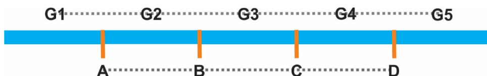
Figure J-1: Diagram showing gaps in data where cut points are assigned

For Star Ratings, the algorithm is run with the goal of determining the four cut points (labeled in the Figure J-1 below as A, B, C, and D) that are used to create the five non-overlapping groups that correspond to each of the Star Ratings (labeled in the diagram below as G1, G2, G3, G4, and G5). For Part D measures, CMS determines MA-PD and PDP cut points separately. Data identified to be biased, erroneous, or excluded by disaster rules are removed from the algorithm. The scores are grouped such that scores within the same Star Rating category are as similar as possible, and scores in different categories are as different as possible.